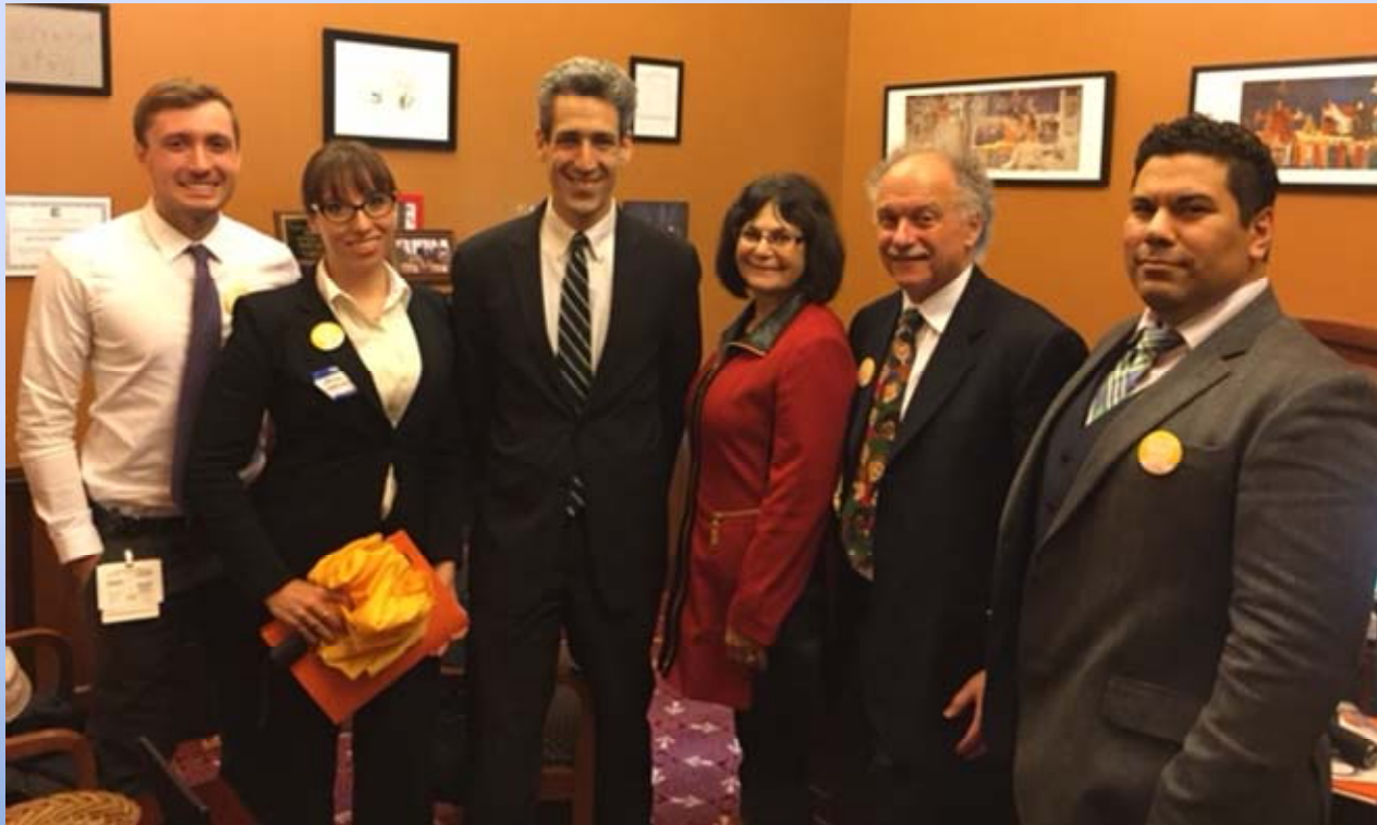
IAFP with Sen. Daniel Biss (Candidate for governor)