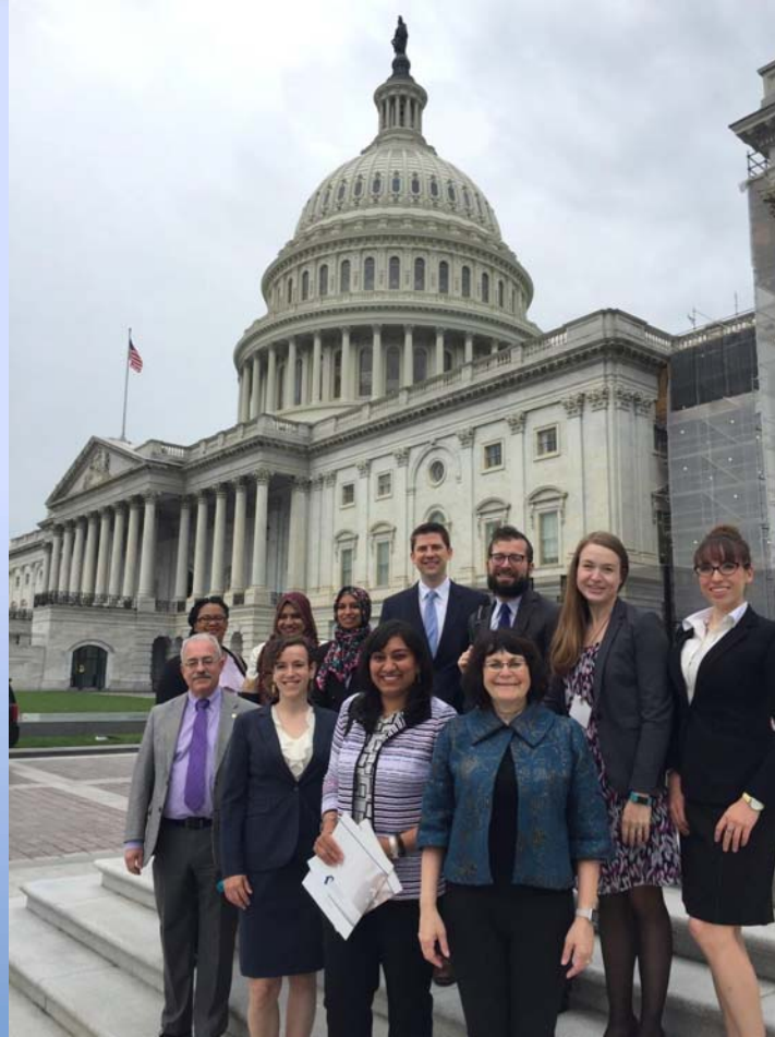
FM Advocacy Summit, Washington, DC 2017